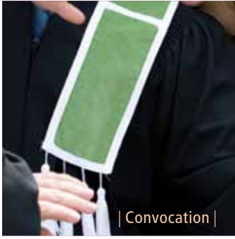
| Convocation |

The Calendar for the 2011-2012 Sessional Dates contains the official academic/registrarial dates for the 2011-2012 academic year and is the College's primary schedule of events.