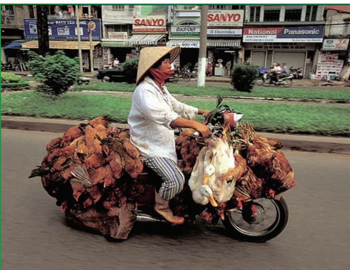
1969 Poultry Wagon at nearly maximum capacity.