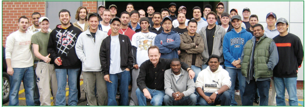
Smiling level 3 A.S.T. students with all the confidence in the world knowing that they will get their licenses now thanks to what we and their employers have given them... a solid Centennial foundation.

CENTENNIAL COLLEGE—SCHOOL OF TRANSPORTATION