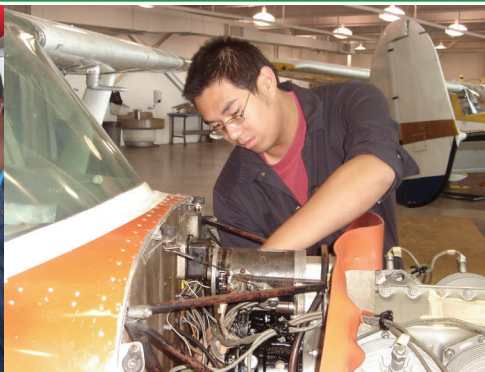
In the Hangar at Ashtonbee