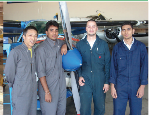
ture of Education