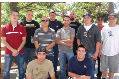
SOME NEW STUDENT FACES AT ASHTONBEE